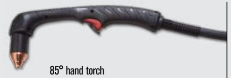
85° hand torch

Duramax® Hyamp™ standard torch styles (for more torch options, see www.hypertherm.com )